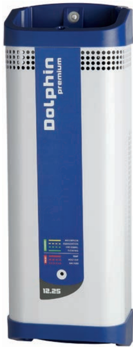
Plug and Play Battery Charger