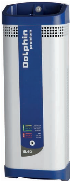
Plug and Play Battery Charger