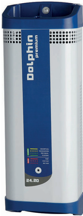
Plug and Play Battery Charger