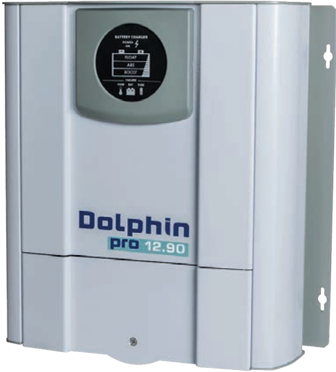
Plug and Play Battery Charger