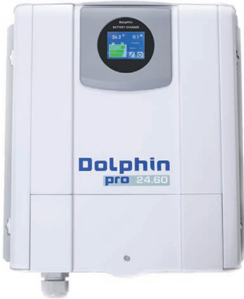
Plug and Play Battery Charger